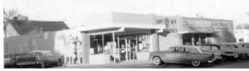
2 1100 W. MOUNTAIN

EAST SIDE GROCERY, c. 1969 Image courtesy Fort Collins Local History Archive, 429mag69.