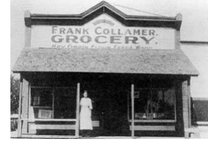
4 313 N. MELDRUM

ELLIS BROS. WEST SIDE GROCERY, c. 1953 Image courtesy Fort Collins Local History Archive, H08625a.