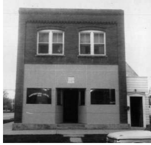
1 429 E. MAGNOLIA

EAST SIDE GROCERY, c. 1969 Image courtesy Fort Collins Local History Archive, 429mag69.