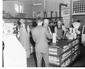
3 700 W. MOUNTAIN

THRIFTY FOODS, c. 1962. Currently BEAVER’S MARKET Image courtesy Fort Collins Local History Archive, 1100Mt62.