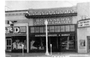
5 152 W. MOUNTAIN

FRANK COLLAMER GROCERY, later EMMA MALABY’S GROCERY, undated photograph.